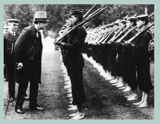
Churchill inspecting naval recruits

Winston Churchill who lived at both Eccleston Terrrace and Morpeth Place was seen by many as the architect behind the failed Gallipoli campaign of 1915.