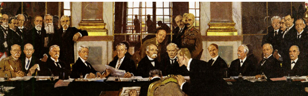
Billy Hughes (far right, standing) The Signing of Peace in the Hall of Mirrors, Versailles, 28th June 1919, William Orpen

As a great patriot and supporter of the British Empire Billy remained Prime Minister until 1923, and continued as a MHR until his death, aged 90, in 1952. He is still the longest-serving member of the Australian Parliament, and one of the most colourful and controversial figures in Australian political history.