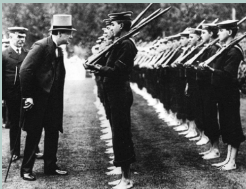
Churchill inspecting naval recruits

Winston Churchill who lived at both Eccleston Terrace and Morpeth Place was seen by many as the architect behind the failed Gallipoli campaign of 1915.