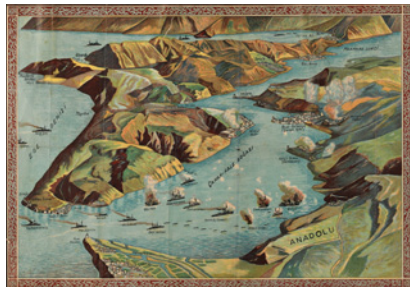
Turkish map of Gallipoli campaign

It was whilst Churchill was living at Morpeth Terrace, Westminster in 1931 that a political commentator commented on his apparently dismal future in politics: "the ghosts of Gallipoli will always rise up to damn him anew," However, we know now that Churchill was to prove this prediction wrong. He became prime minister in 1940 with Britain again at war and on taking office, he wrote, "All my past life had been a preparation for this hour and for this trial." That preparation included Gallipoli.