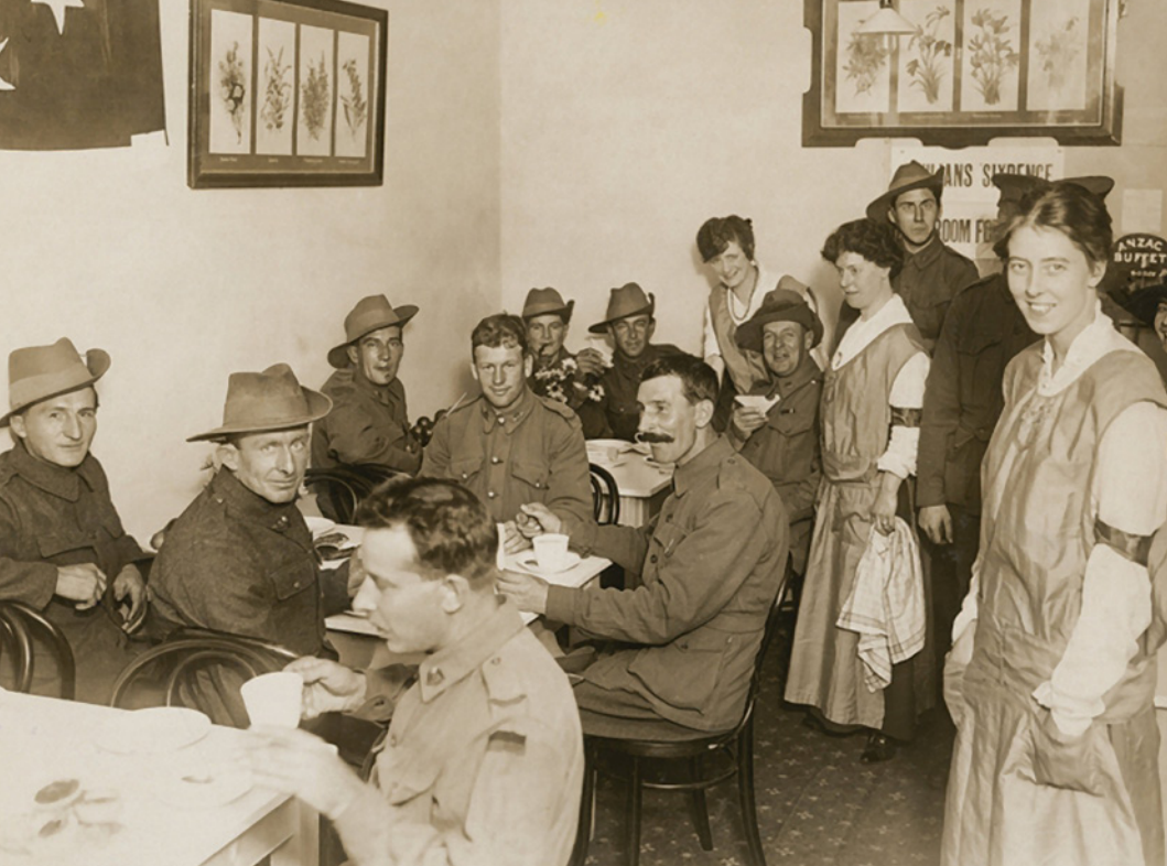
Interior of ANZAC Buffet